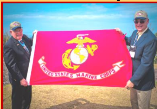
Woody Williams, MOH Recipient

Iwo Jima: Chartered IJAA 737 Flight to Iwo Jima; Mt Suribachi and the "Black Sands" landing beaches & IJAA Memorial Service.